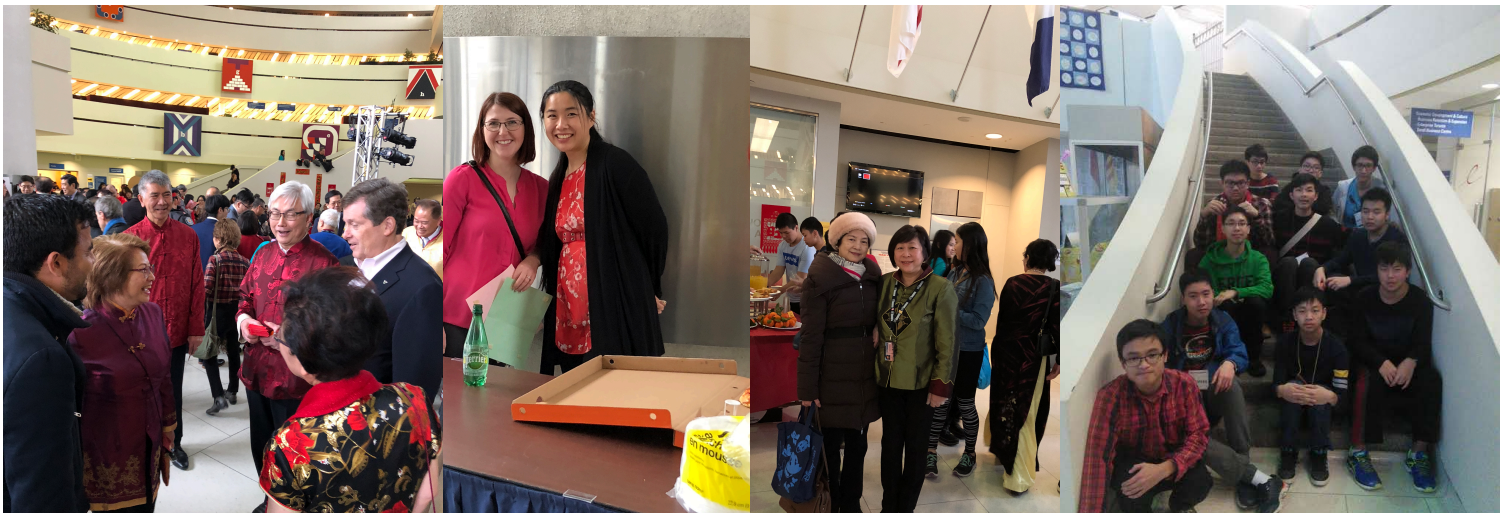
Photo collage from February 17 Lunar New Year Reception hosted by my office and the Mayor's office at Scarborough Civic Centre - Thank you to volunteers and community members for your help in making it a successful event!

植樹活動 | 2018年5月15日星期二 | 上午10點 - 下午12點 管理工作 | 2018年6月5日星期二 | 上午10點 - 下午12點