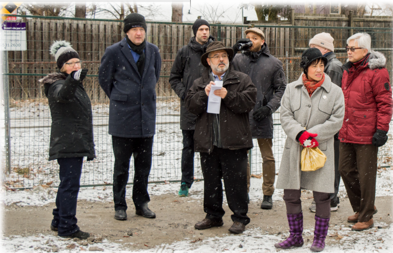
Site Meeting with Metrolinx and residents from Agincourt Village Community Association