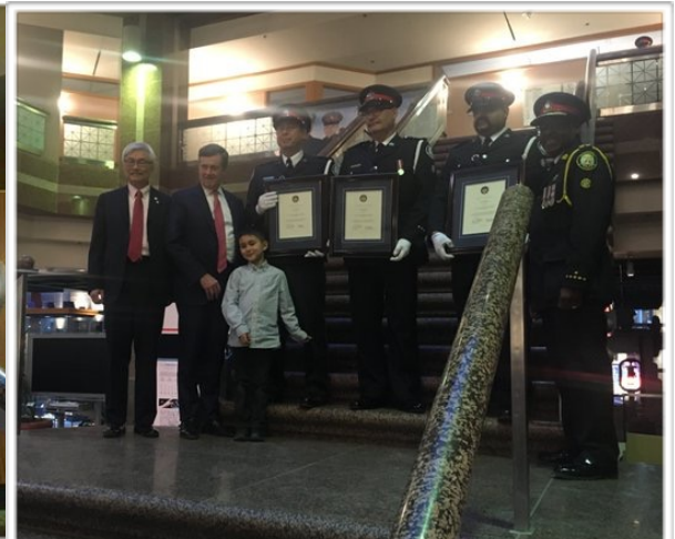
Recognizing 53 Toronto Police officers who went above and beyond their call of duty for the safety and wellbeing of the city.